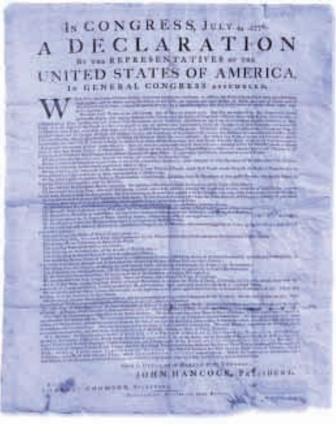
The Chicago Historical Society's copy of the Declaration of Independence

he Declaration of Independence, the Constitution and Bill of Rights, and the Emancipation Proclamation are often referred to collectively as the Documents of Freedom. As a group, these documents demonstrate the evolution of American democracy and freedoms. This lesson focuses on the public reaction to the publishing of the Declaration of Independence, the Constitution, and the Emancipation Proclamation. It is best used after students are familiar with the events that led to the writing of these documents. Students should have a basic knowledge of the Revolutionary War, early American government, slavery, and the Civil War.