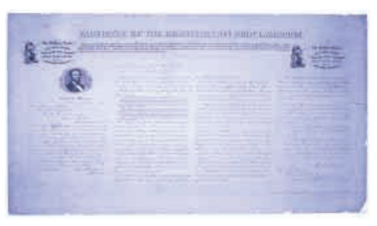
The Chicago Historical Society's copy of the Emancipation Proclamation