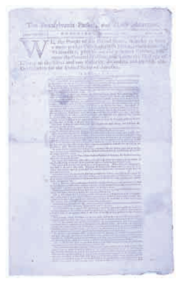
The Chicago Historical Society's copy of the Constitution